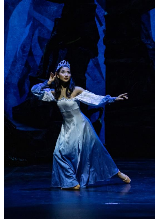
Spirit of the Sea