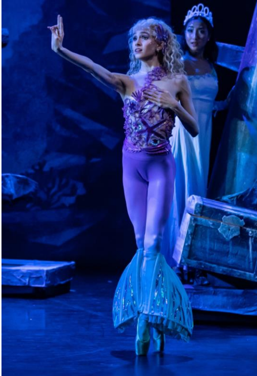
The Little Mermaid