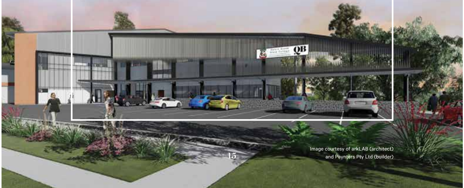
Image courtesy of arkLAB (architect) and Paynters Pty Ltd (builder)