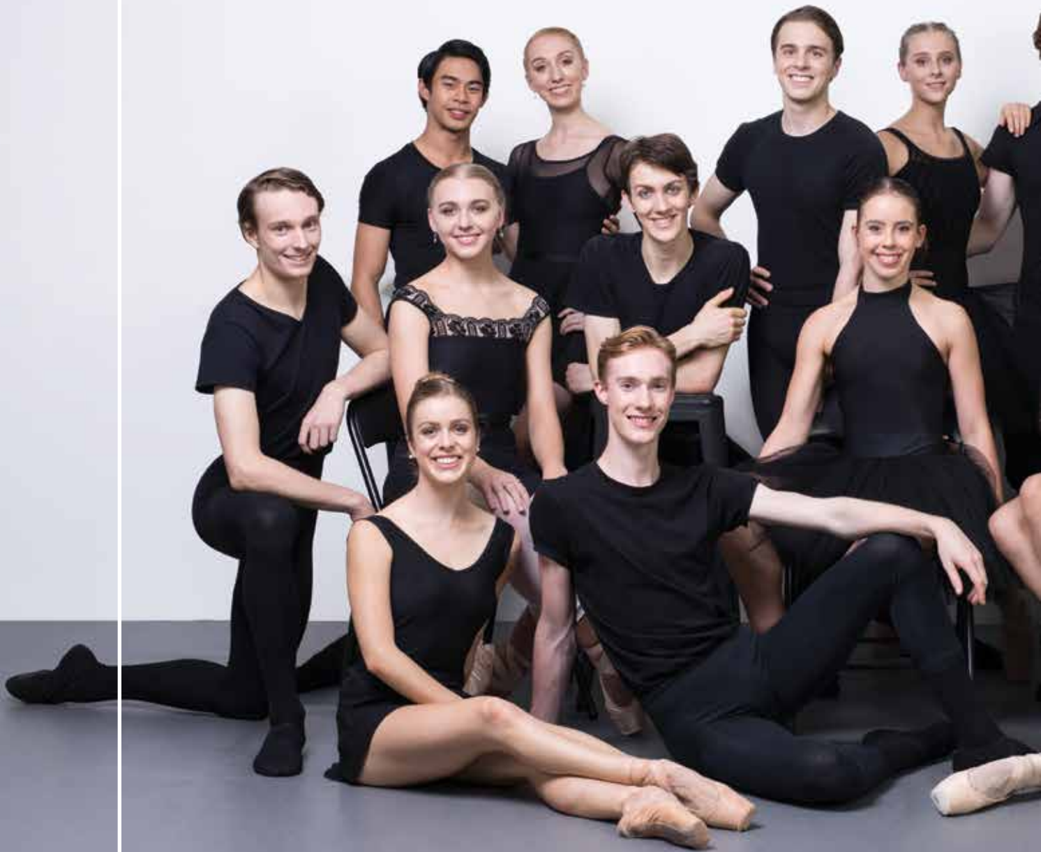
Front and Inside Cover: Photography by David Kelly